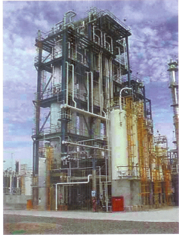
Ethylamine Plant – South Korea